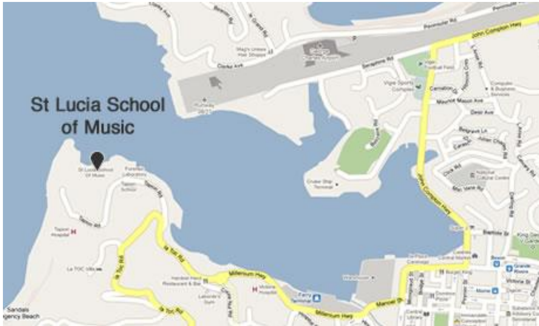
map of Vieux-Fort